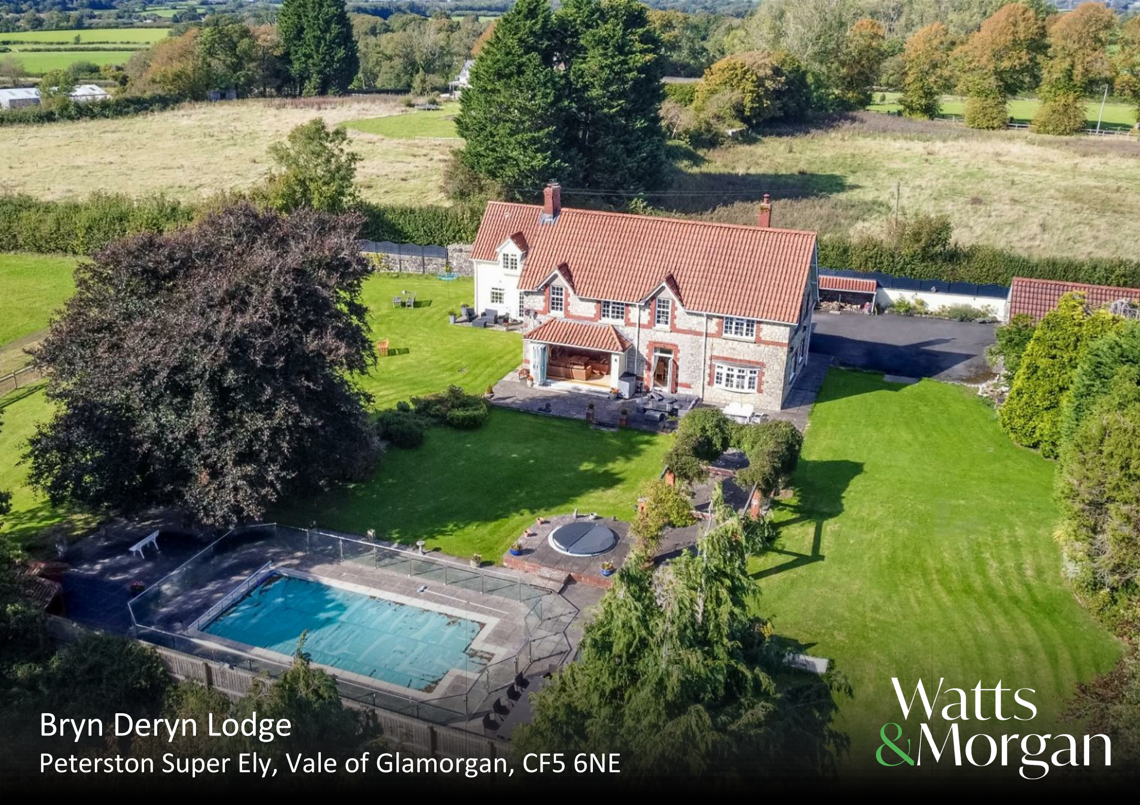
Bryn Deryn Lodge Peterston Super Ely, Vale of Glamorgan, CF5 6NE