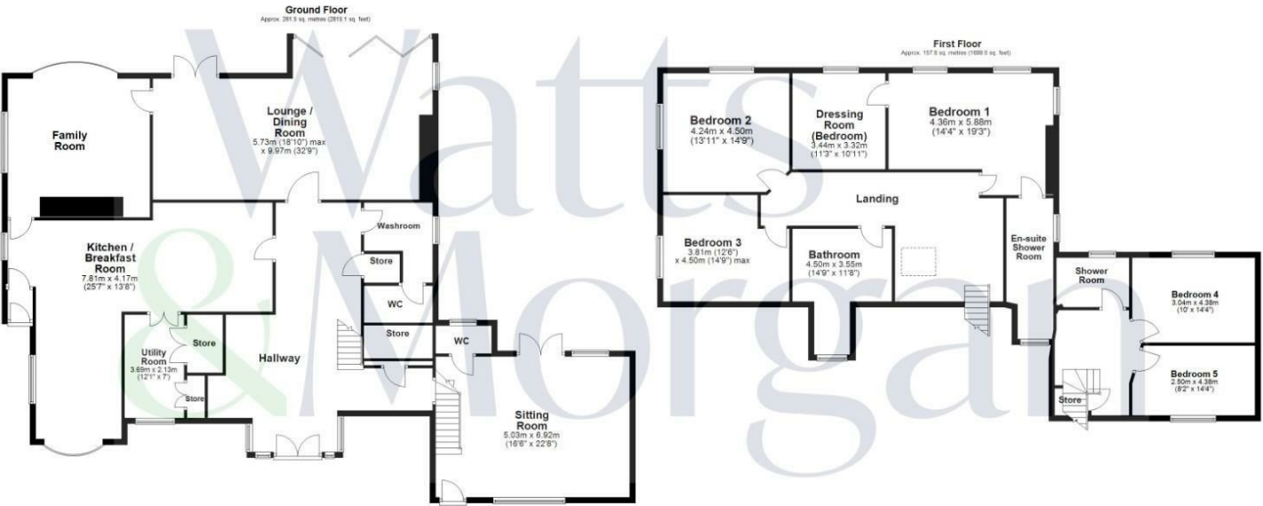
Total area: approx. 419.4 sq. metres (4514.1 sq. feet)